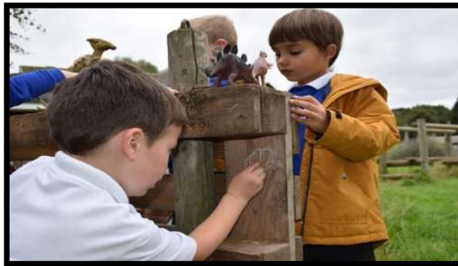
The Dino Hotel