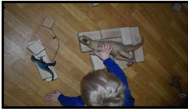
The Dinosaur House

The children in Early Years have a great interest in dinosaurs. The interest has been so big, children now have their own areas of provision dedicated to exploring dinosaurs. The children have been learning about where dinosaurs used to live, what they used to eat (the children know the correct terminology for these groups) how they died and where their bones are now! The children have had great fun categorising the dinosaurs by their features and learning about different parts of the world and how this is different to where we live as well as hunting for our very own fossils!