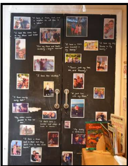
Family Photo Displays