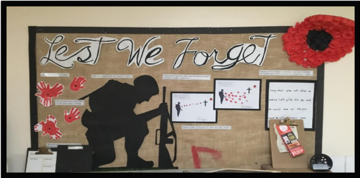
Our Remembrance wall... Lest we forget!