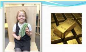
"Royalty have treasures and gold."

Although we do not have our community worship at the moment, exploring faith and the impact of this on our daily lives is still at the heart of life at BB. The pupils take part in daily worship and reflection where they are given the opportunity to grow in their personal faith. Combined with our Personal Development and RE sessions, these give our pupils the time to explore faith—asking and answering questions, participating in discussions and debates or simply having some quiet time to reflect, think and pray. Have you watched our weekly worship videos on Facebook? It's a great way to stay updated with what we've been up to in school!