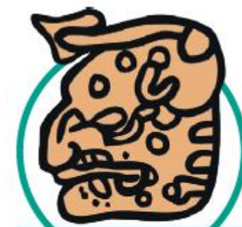
The Maya logogram for b'alam - jaguar