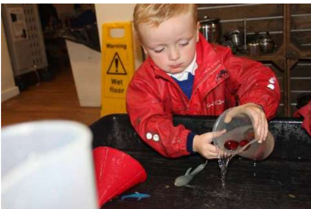
Sink or float?